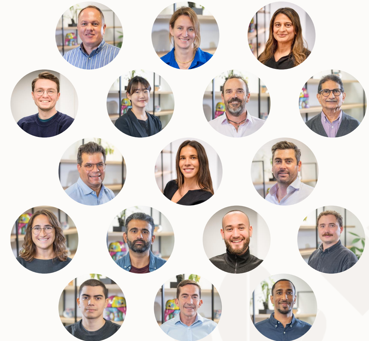
The Team (London):

We believe strong relationships and collaborative thinking are essential to long-term success.